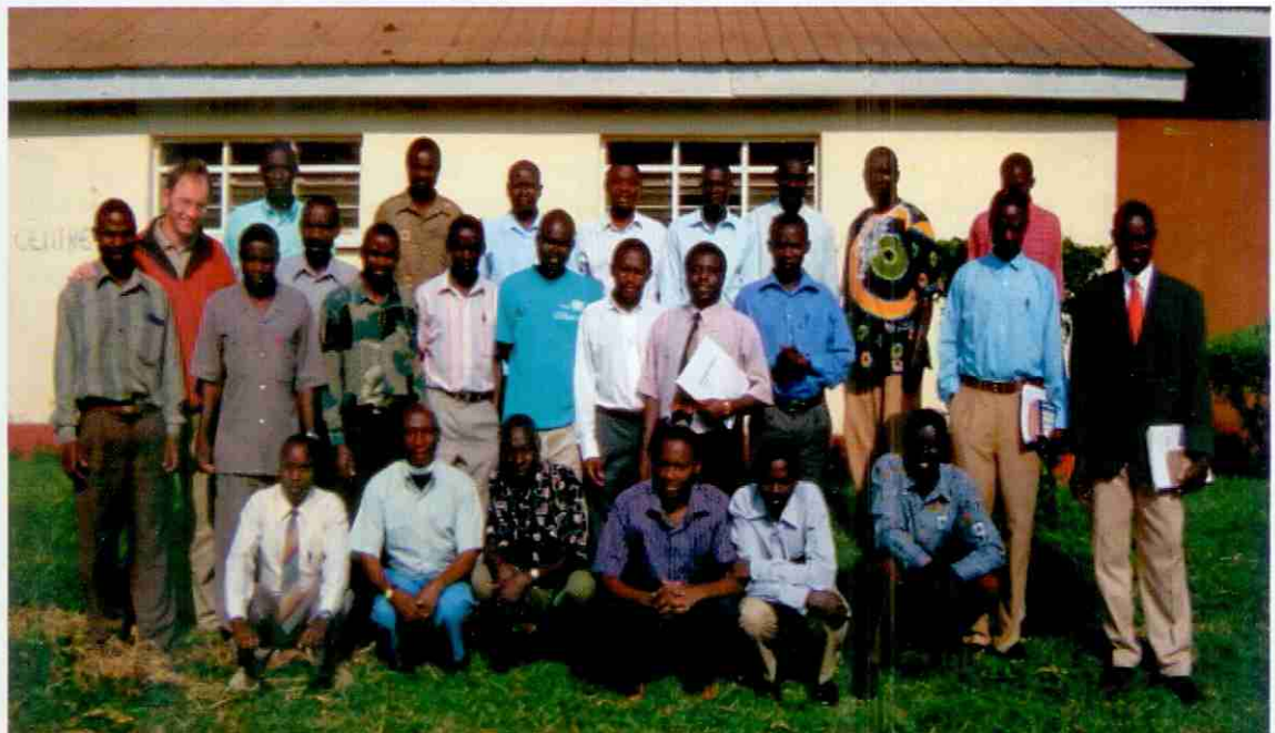
Our Facilitators from the Pentecostal Assemblies of God

to provide the needed leaders but their method of training has not changed since the 1960's and the training they do provide, is hugely expensive and too often irrelevant to the present needs in society. Not to mention the fact that the residential institutional approach simply has not got the ability to provide the number of leaders needed now or for the church of tomorrow.